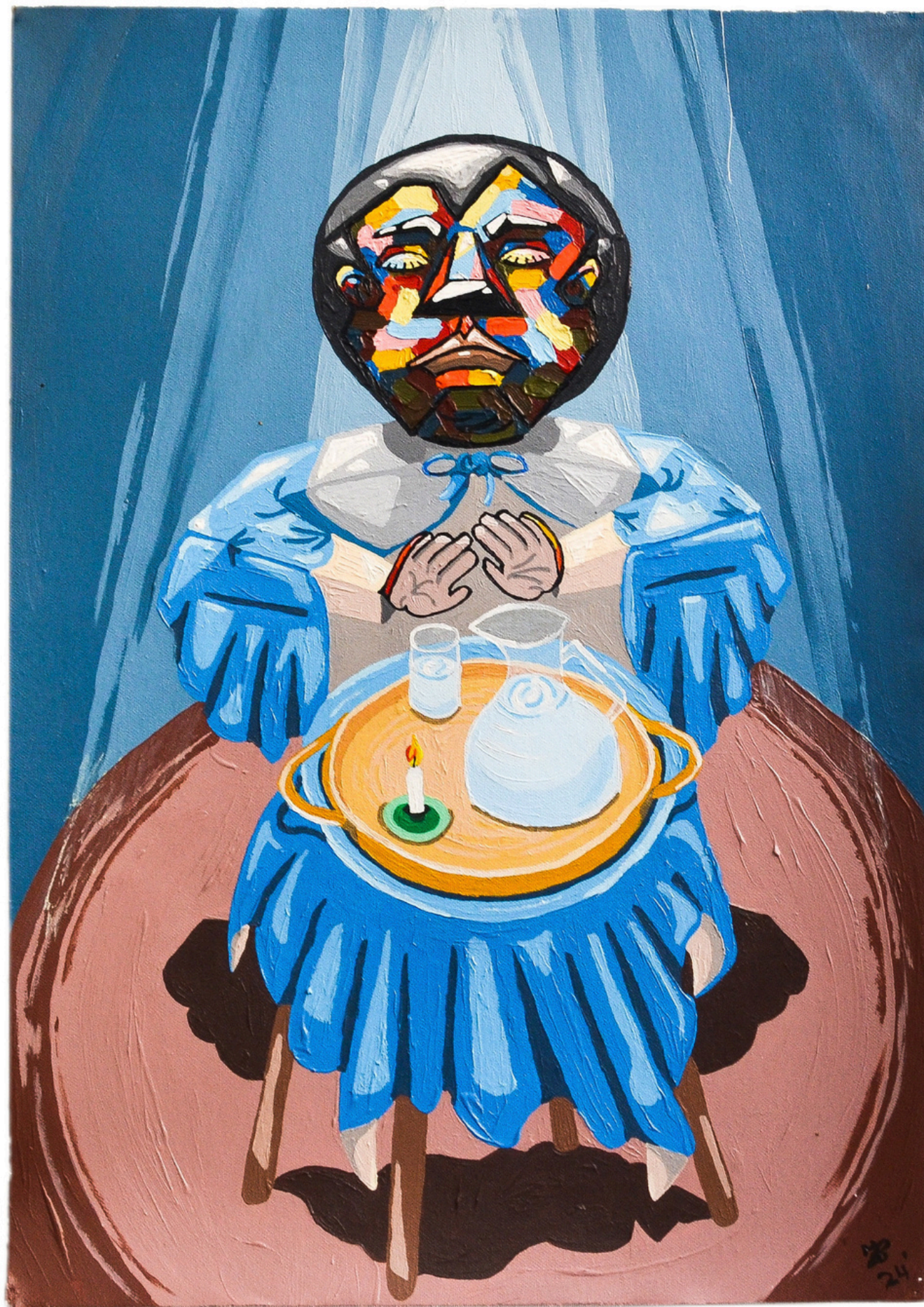
Metsi A Halalelang, 2024 Acrylic on canvas 73.5 x 56.5 cm R6 900 Incl. Vat