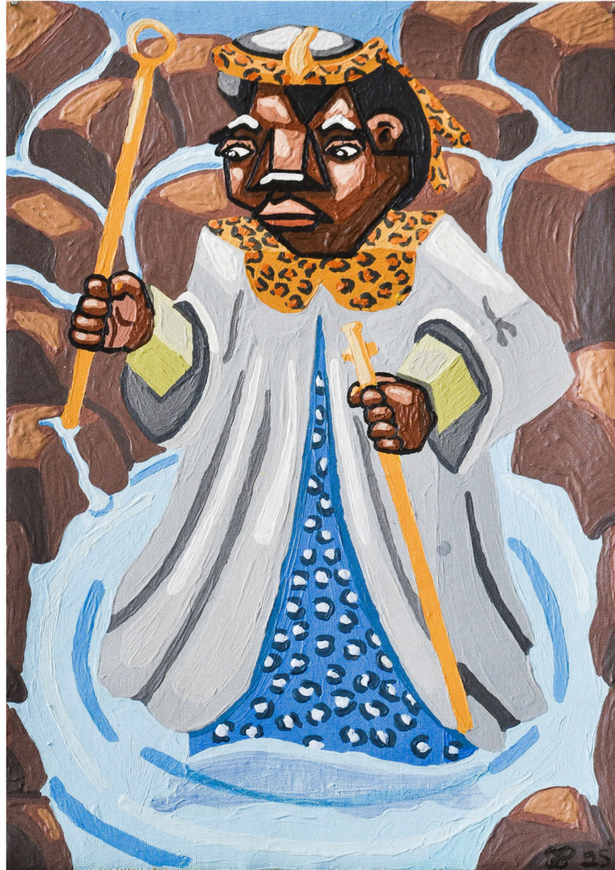
Indlondlo Yamanzi/ King of Water, 2025 Acrylic on canvas 56.5 x 44.5 cm R5 750 Incl.VAT