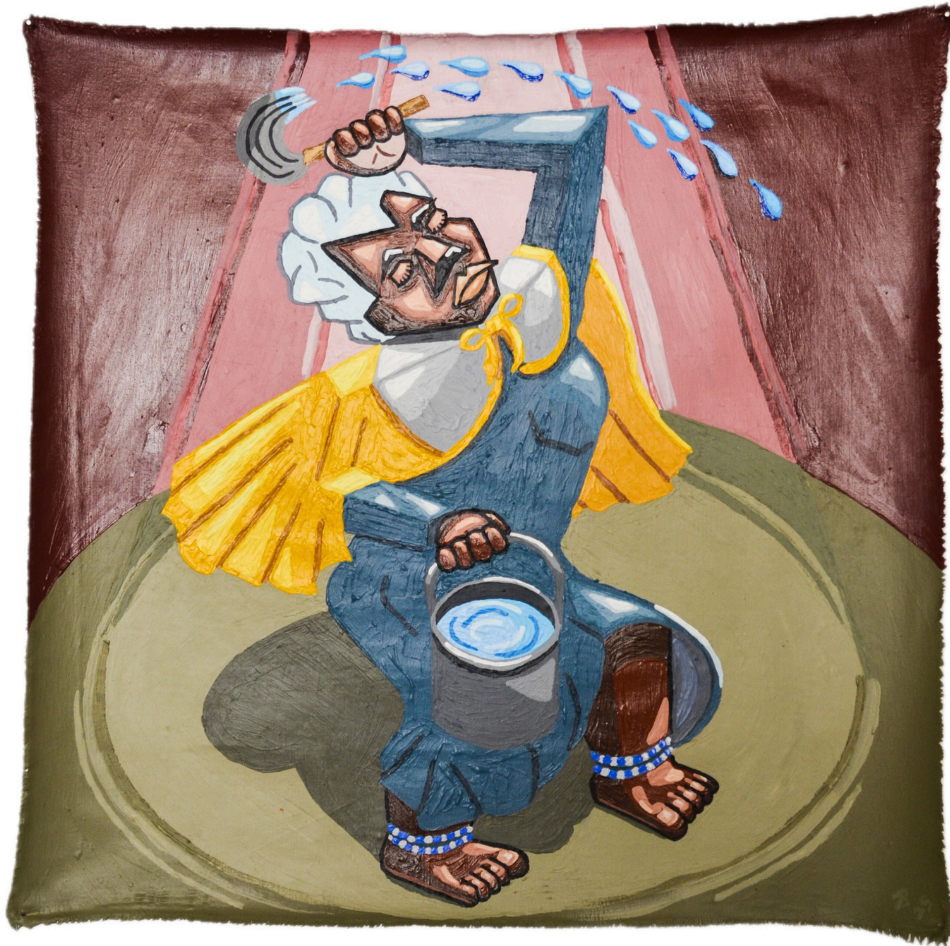
Tiisetso, 2025 Acrylic on canvas 84.5 x 84.5 cm R8 625 Incl.VAT