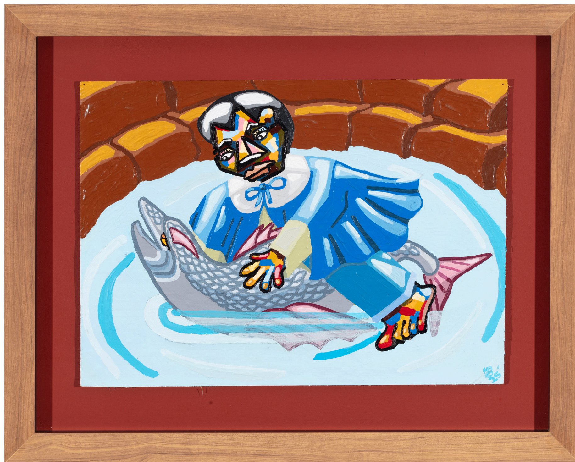
Water Spirit Guide, 2025 Acrylic on canvas 56.5 x 44.5 cm R5 750 Incl.VAT