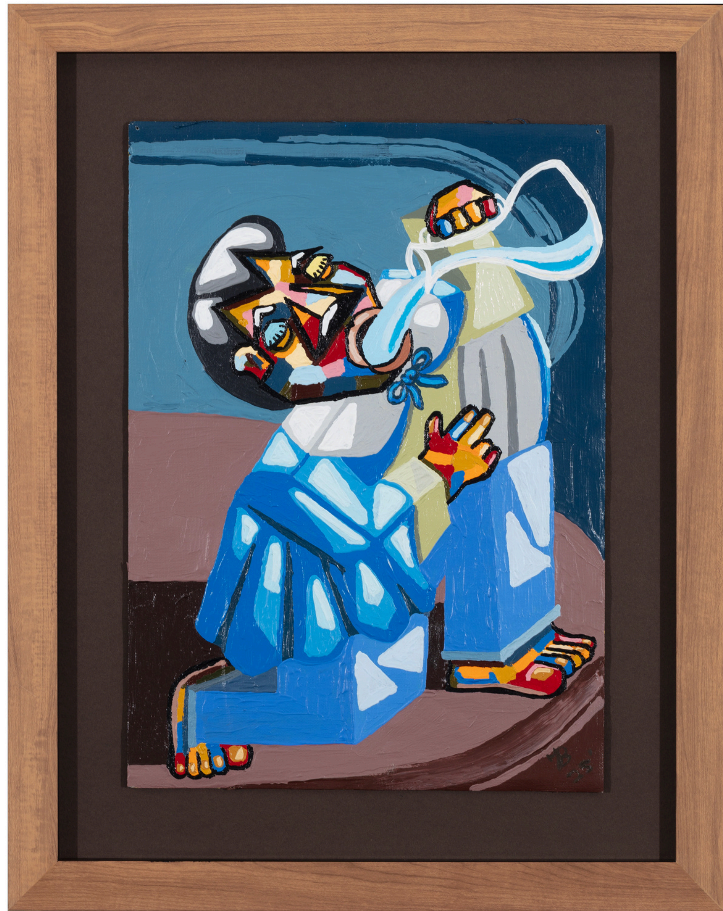
The Purge In, 2025 Acrylic on canvas 56.5 x 44.5 cm R5 750 Incl. Vat