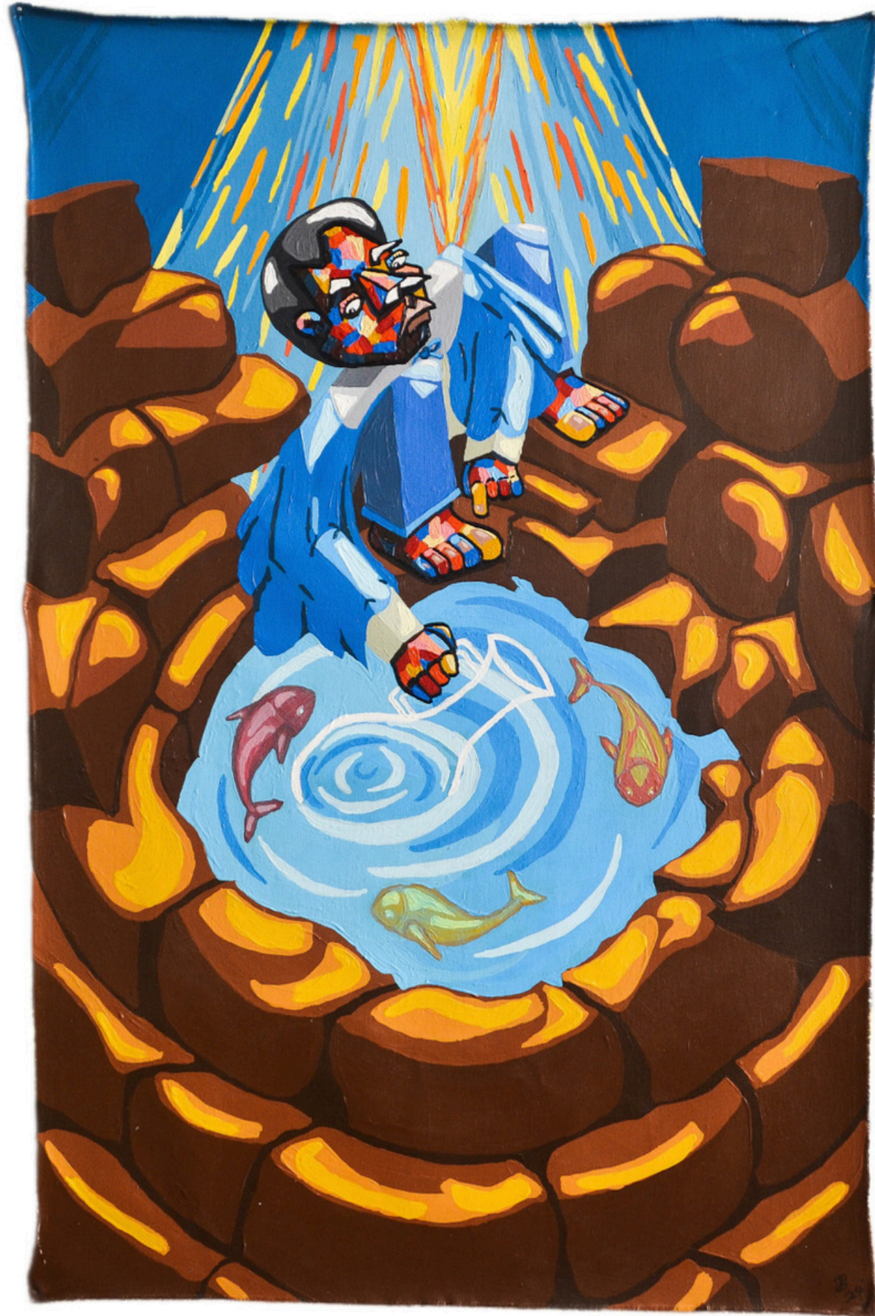
Sedibeng, 2024 Acrylic on canvas 134 x 94.8 cm R13 800 Incl. Vat