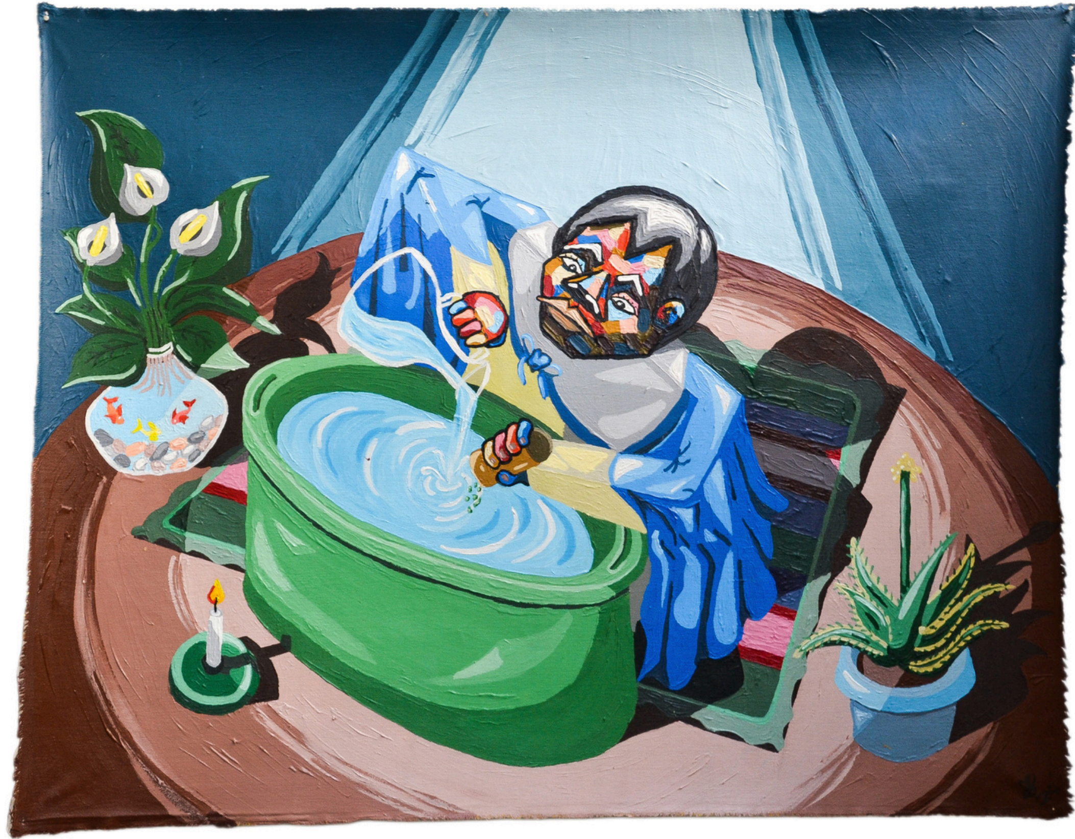
Bath Time, 2024 Acrylic on canvas 74.5 x 91.6 cm R8 625 Incl. Vat