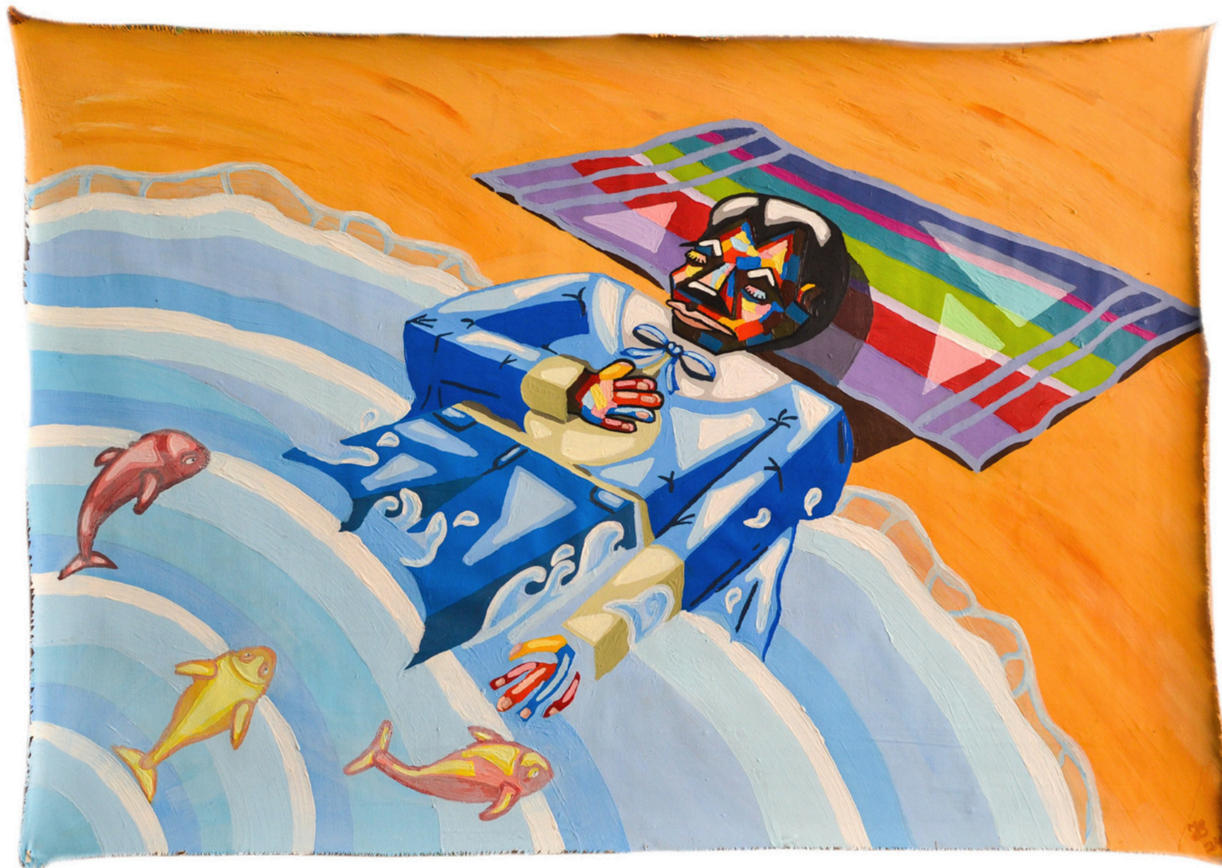
Beach Boy, 2024 Acrylic on canvas 95.9 x 131.7 cm R13 800 Incl. Vat