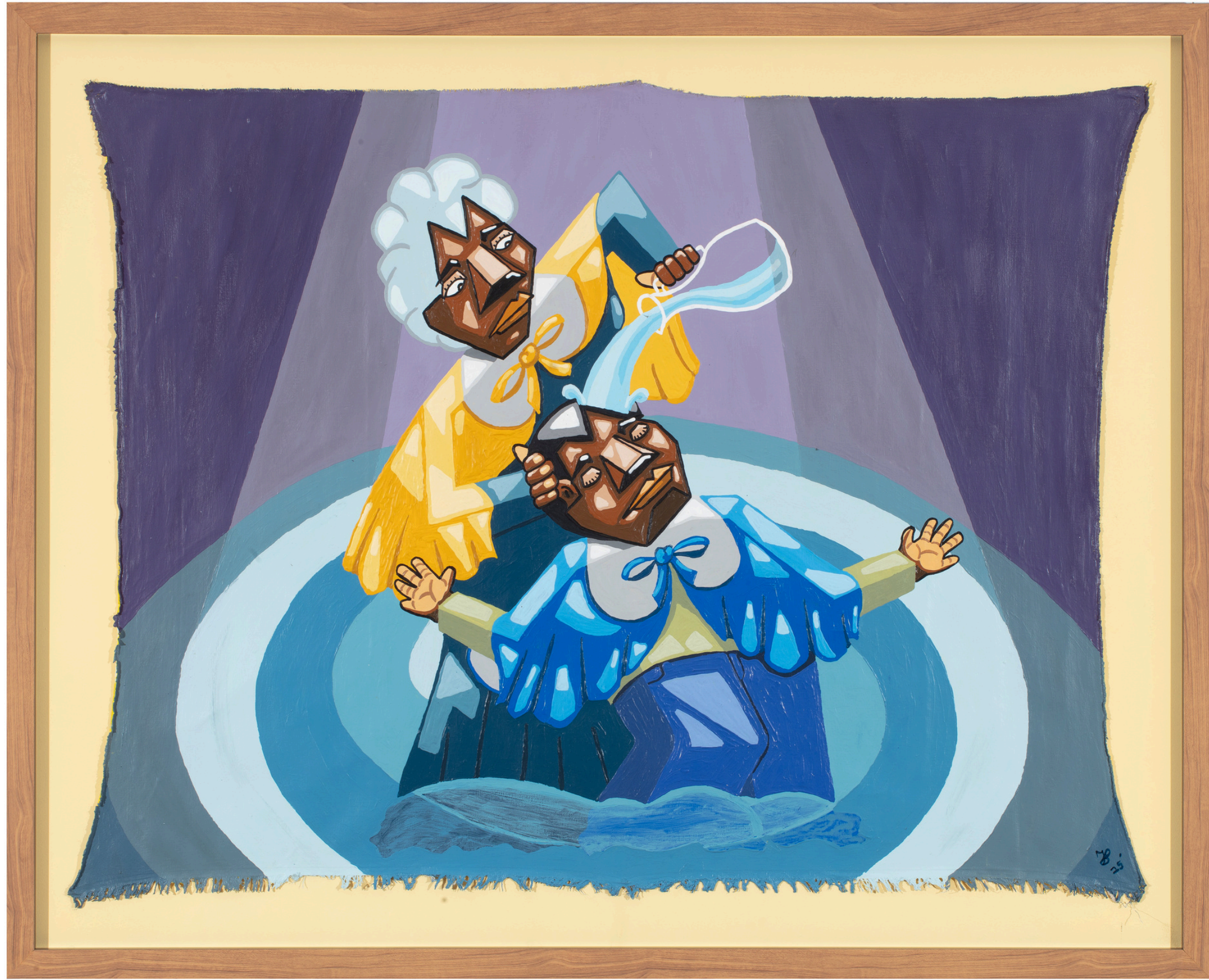
Kolobetso, 2025 Acrylic on canvas 94.9 x 119.8 cm R12 650 Incl.VAT