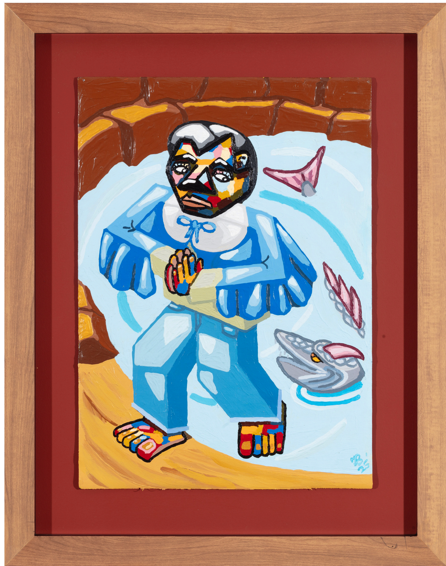
Born Again, 2025 Acrylic on canvas 56.5 x 44.5 cm R5 750 Incl.VAT