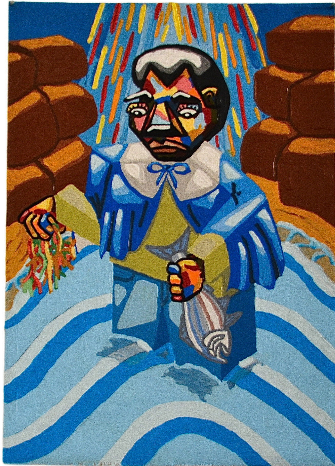
Sea-Crits In The Water, 2025 Acrylic on canvas 56.5 x 44.5 cm R5 750 Incl.VAT