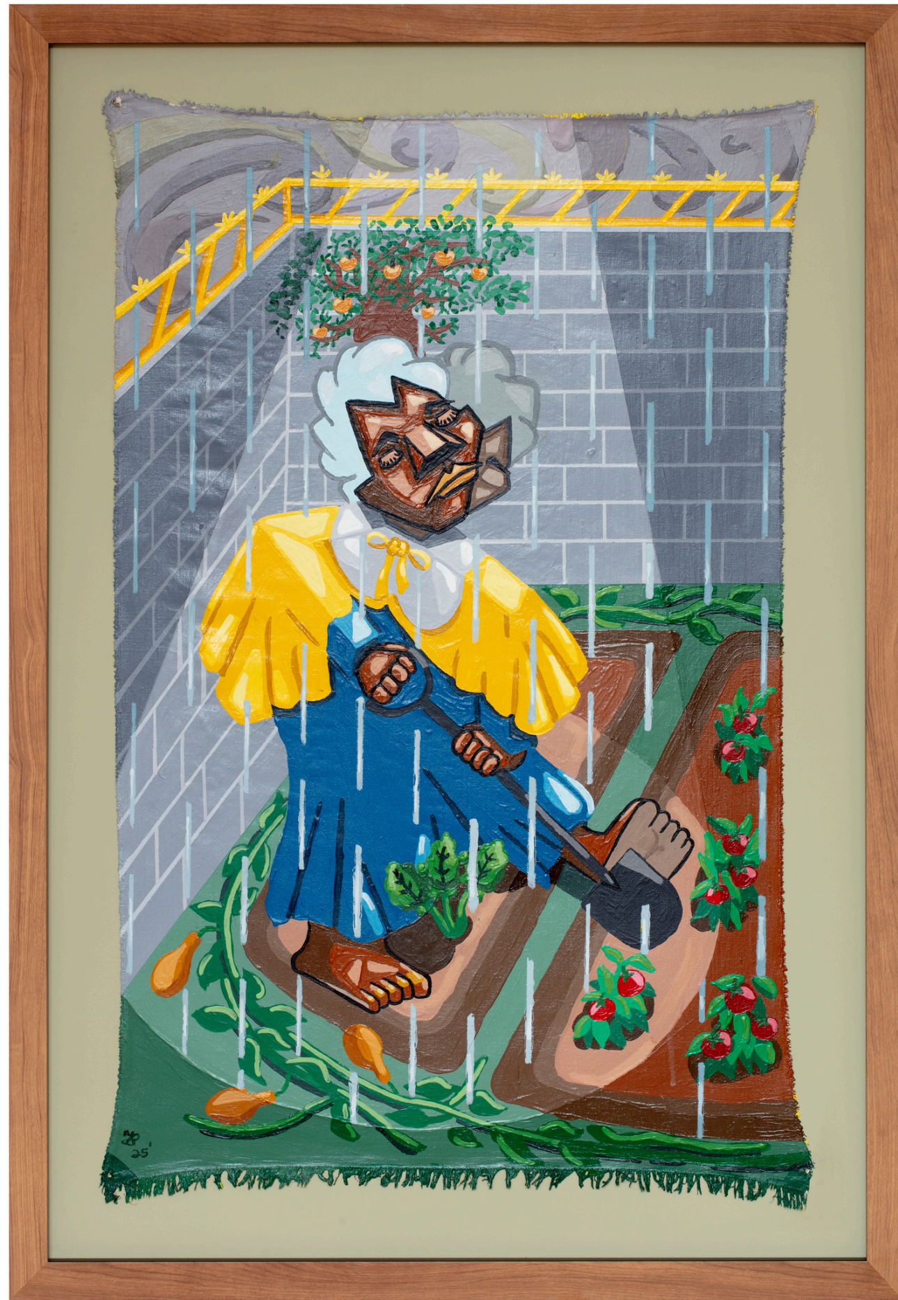
Lefa La Pula I, 2025 Acrylic on canvas 98.5 x 68.5 cm R8 625 Incl.Vat