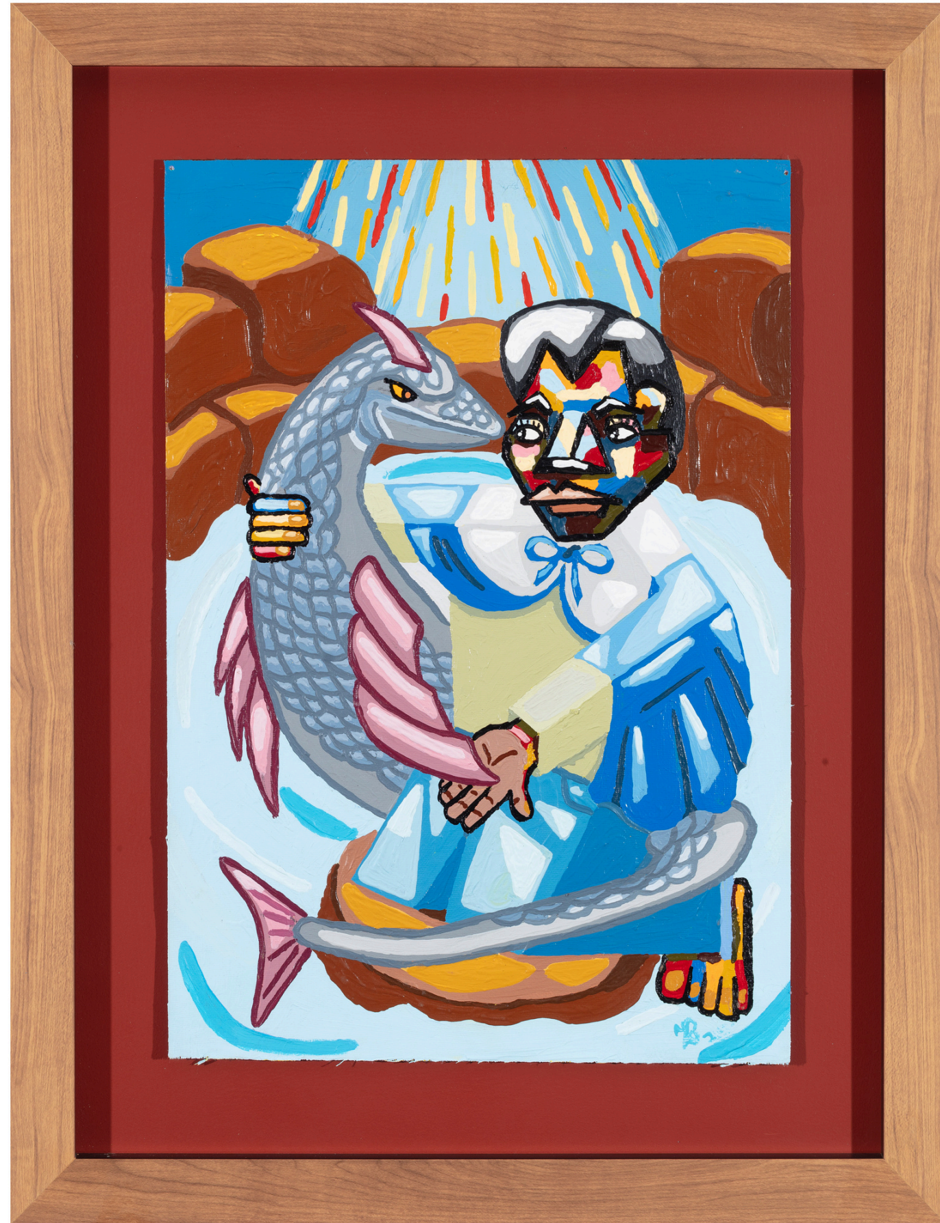
Man Meets Water Spirit, 2025 Acrylic on canvas 56.5 x 44.5 cm R5 750 Incl.VAT