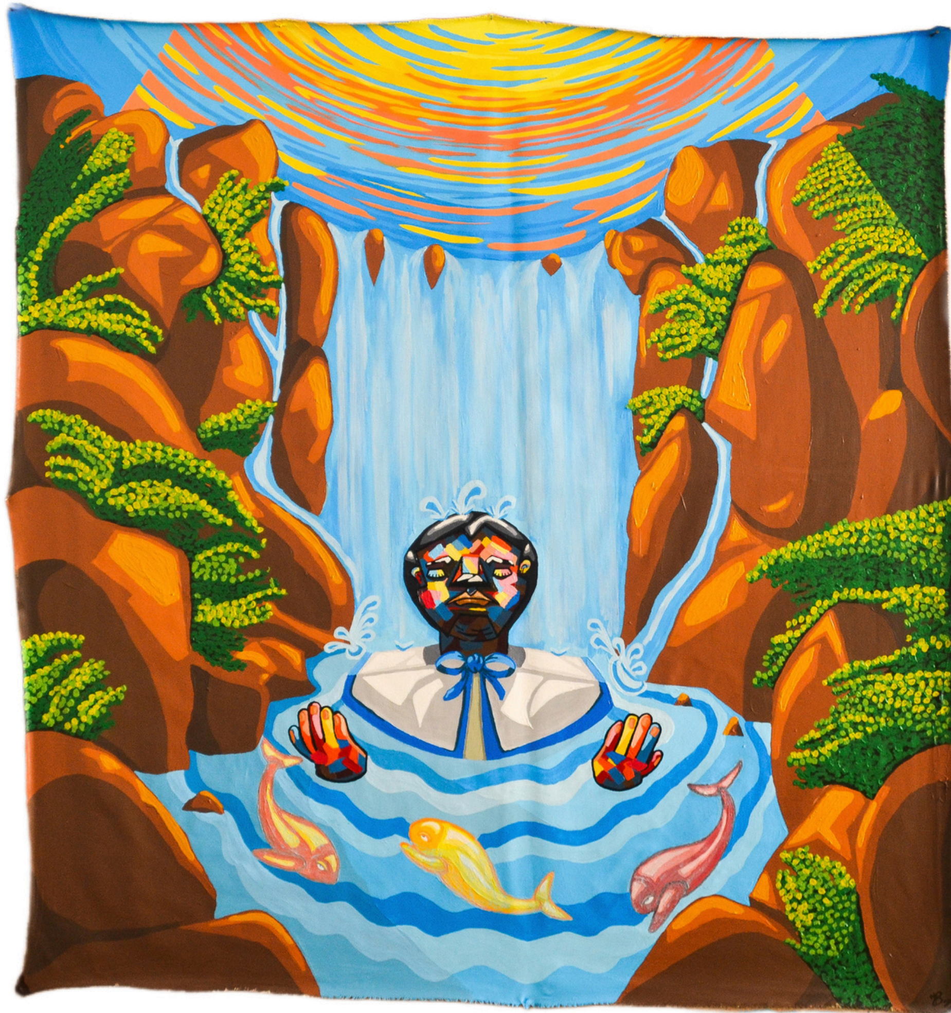
Falls of Healing (Kolobetso), 2024 Acrylic on canvas 175 x 165 cm R27 600 Incl. Vat