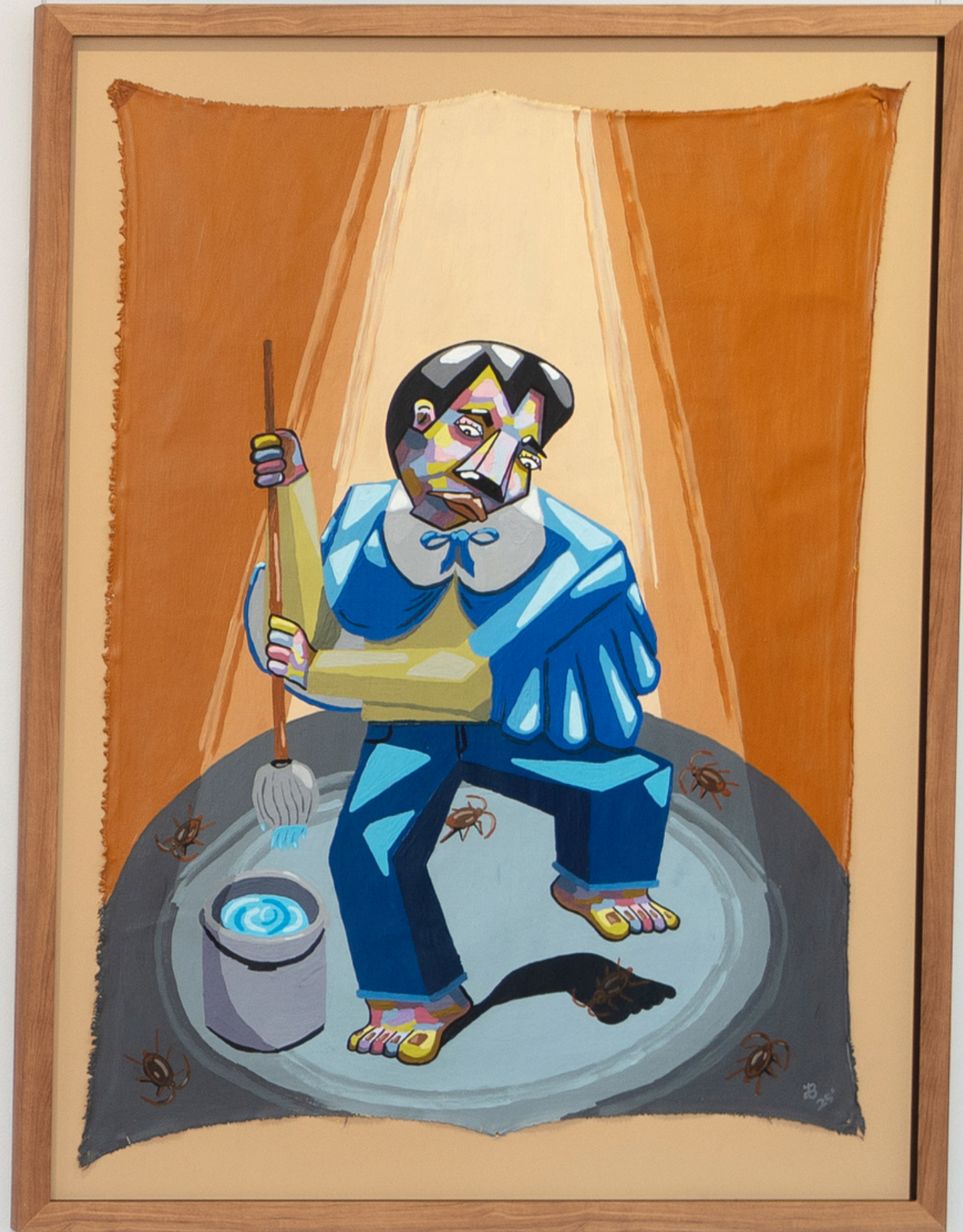
Tsireletso, 2025 Acrylic on canvas 122.2 x 94.7 cm R12 650 Incl. Vat