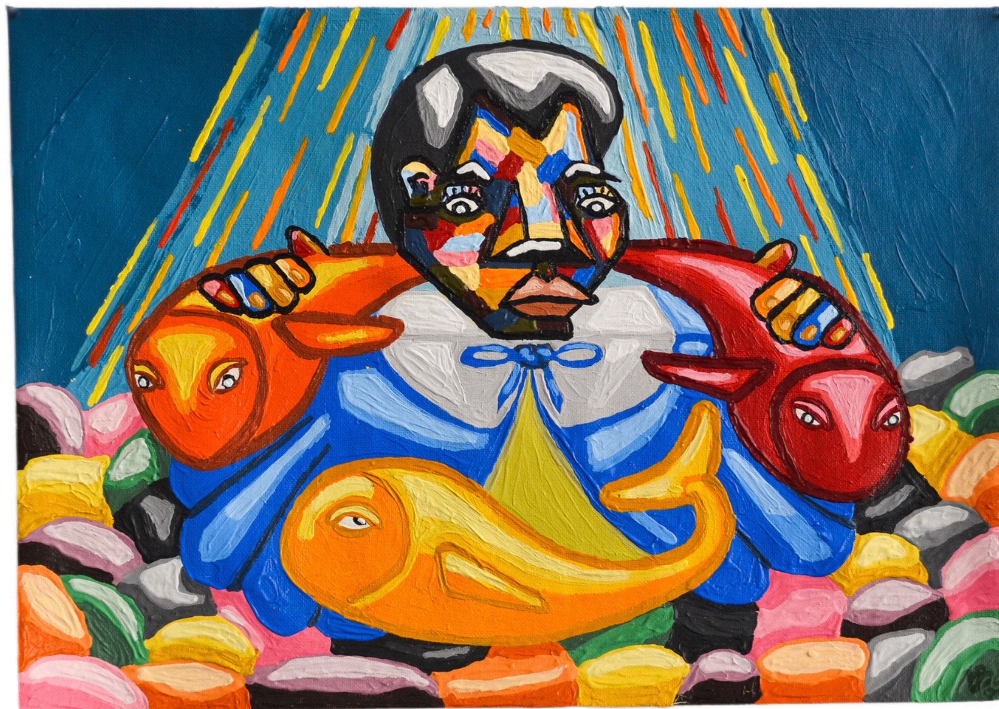
O Mahlohonolo, 2025 Acrylic on canvas 56.5 x 44.5 cm R5 750 Incl. Vat