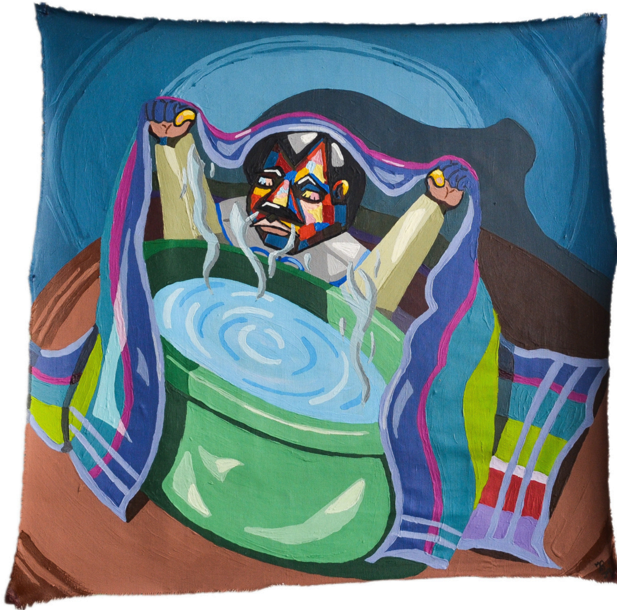
Ho Leleka Mafu / Exorcism of Diseases, 2024 Acrylic on canvas 84.5 x 84.5 cm R8 625 Incl. Vat