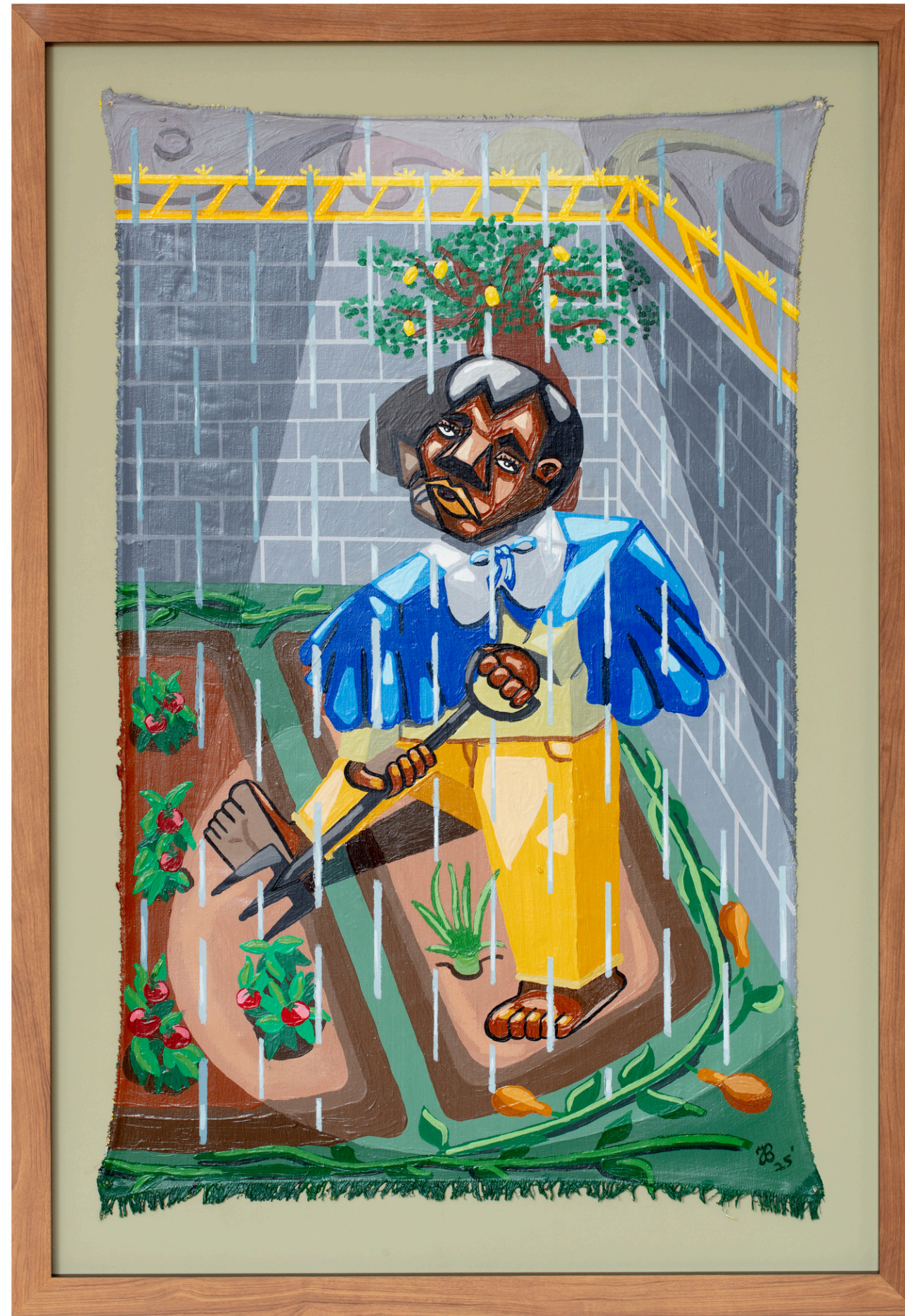
Lefa La Pula II, 2025 Acrylic on canvas 98.5 x 68.5 cm R8 625 Incl.VAT