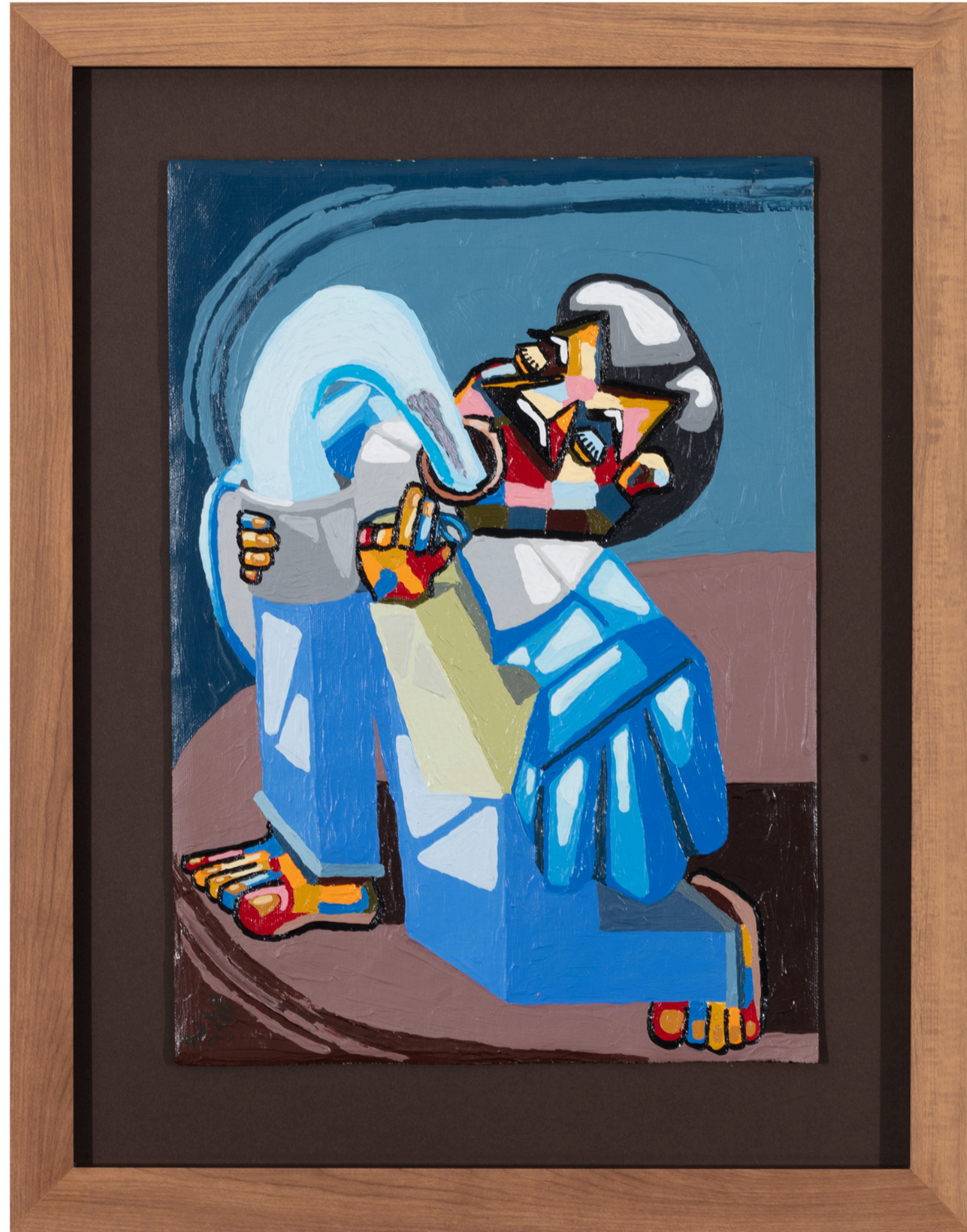
The Purge Out, 2025 Acrylic on canvas 56.5 x 44.5 cm R5 750 Incl. Vat